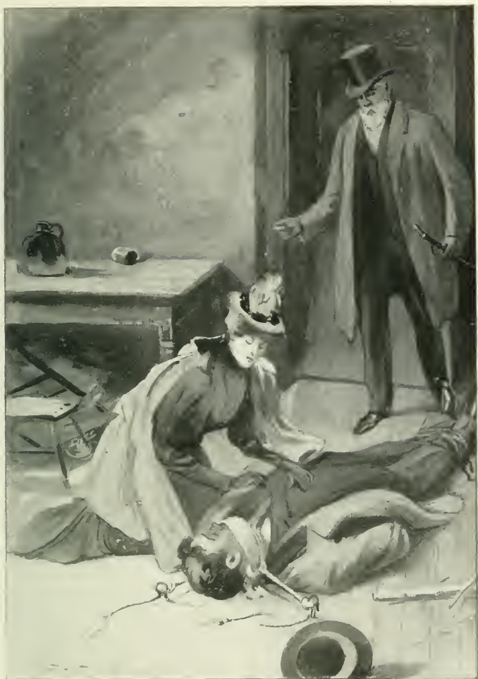
She was on her knees beside him.—Page 219